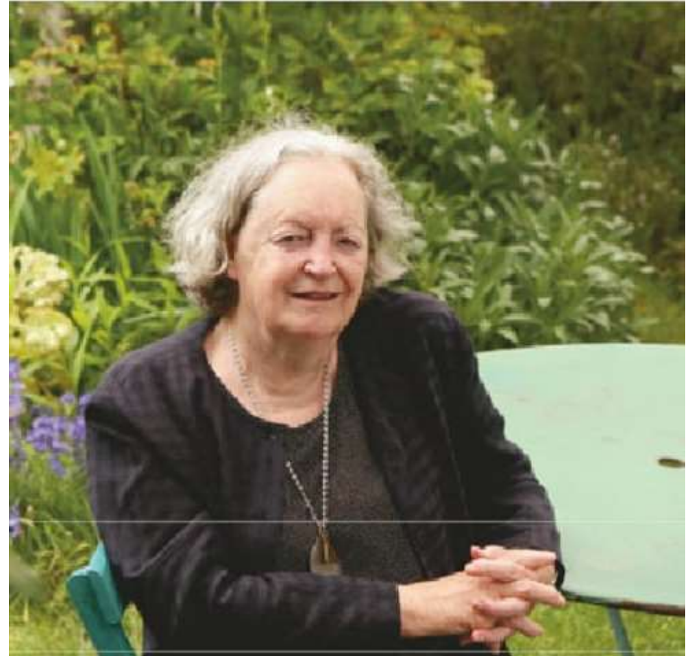
Renée Gailhoustet on her terrace in her apartment (Le Liegat, Ivry)