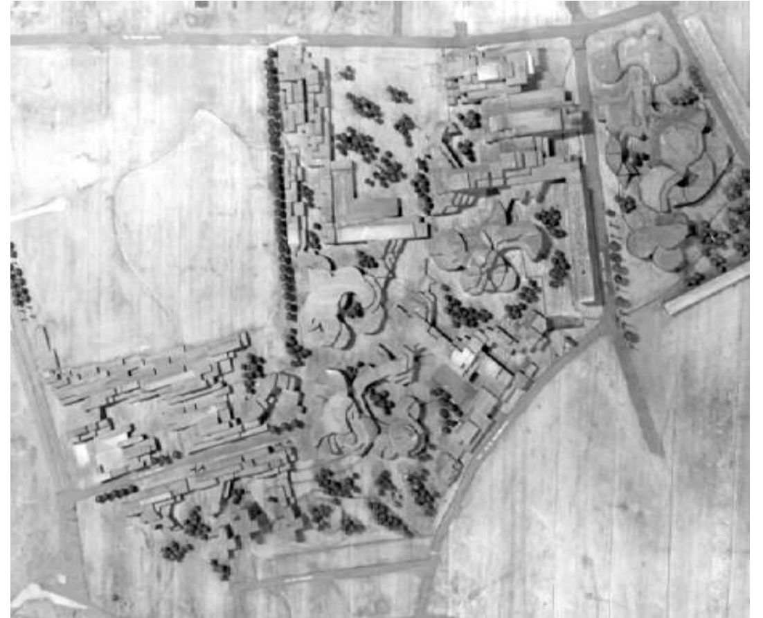
Conceptual model of the Maladrerie project.