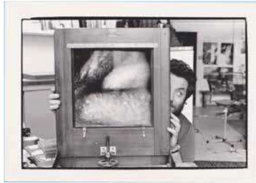
© Nicolas Fremiot, Marc Pataut, photograph